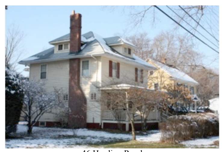
46 Harding Road