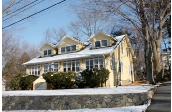
75 Bertwell Road