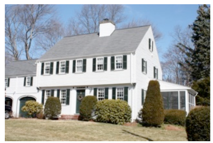
97 Blake Road