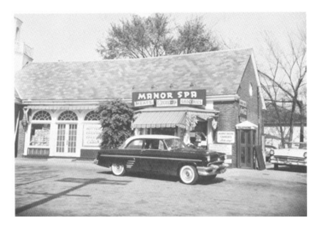
Manor Crescent (no longer extant)

MASSACHUSETTS HISTORICAL COMMISSION 220 MORRISSEY BOULEVARD, BOSTON, MASSACHUSETTS 02125