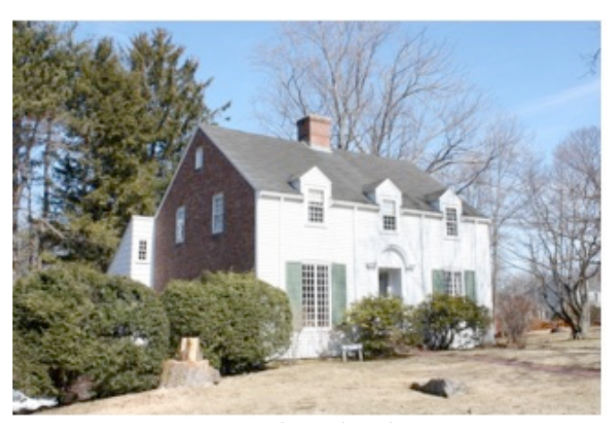
100 Simonds Rd.