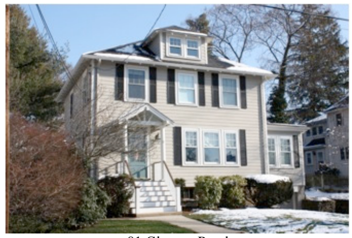
81 Gleason Road