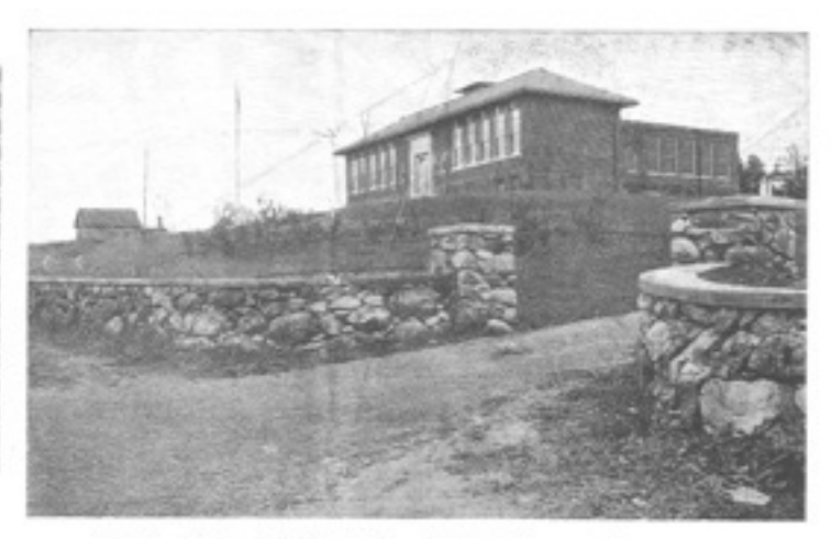
Parker School, Bedford Street, directly opposite property.

You owe it to your children to own your home, where you can be independent. Stop buying houses for Landlords. Start owning your home. You can make your rent money pay for your home in Lexington Manor.