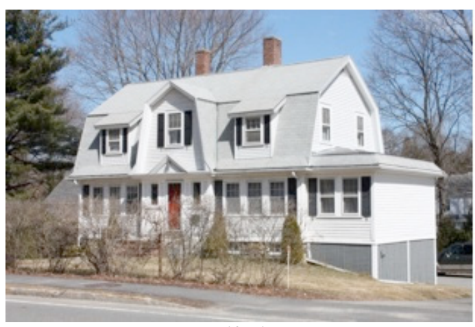
293 Bedford Street