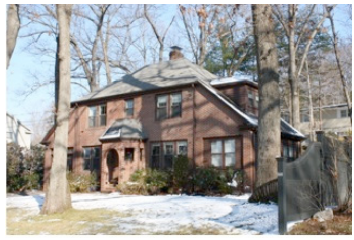
7 Dexter Road