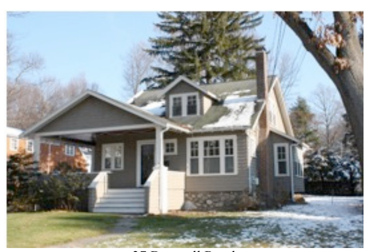
37 Bertwell Road