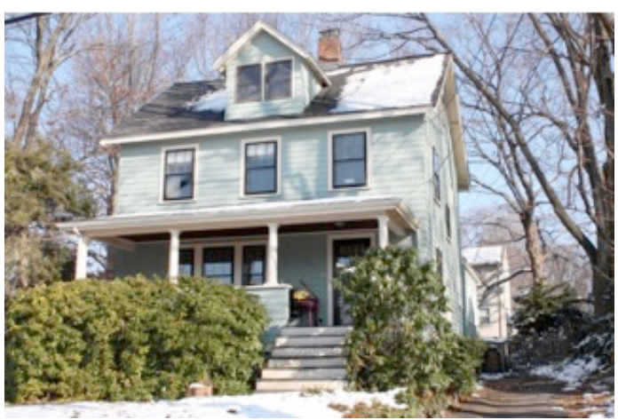
65 Gleason Road