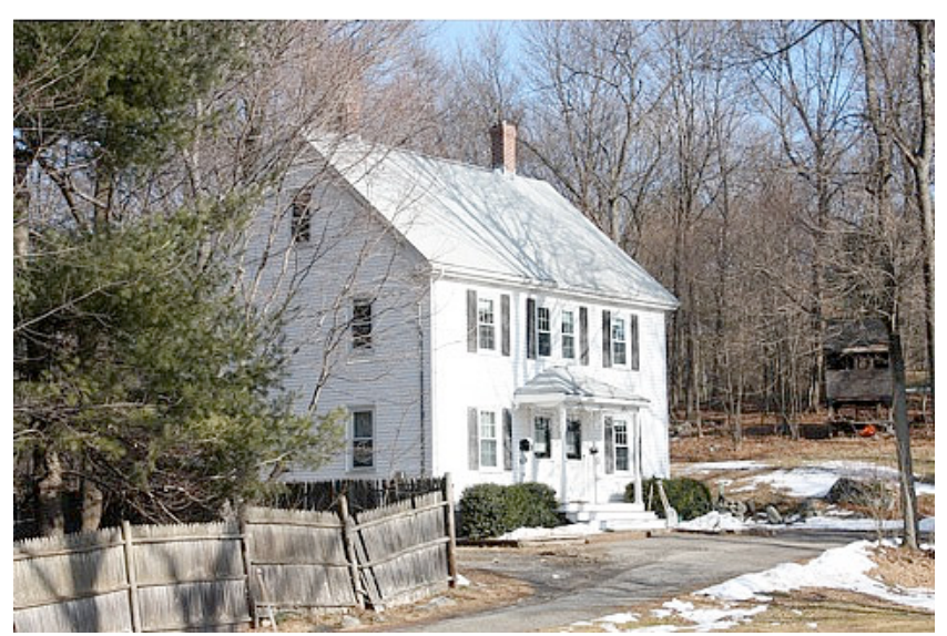
3-5 Utica Street