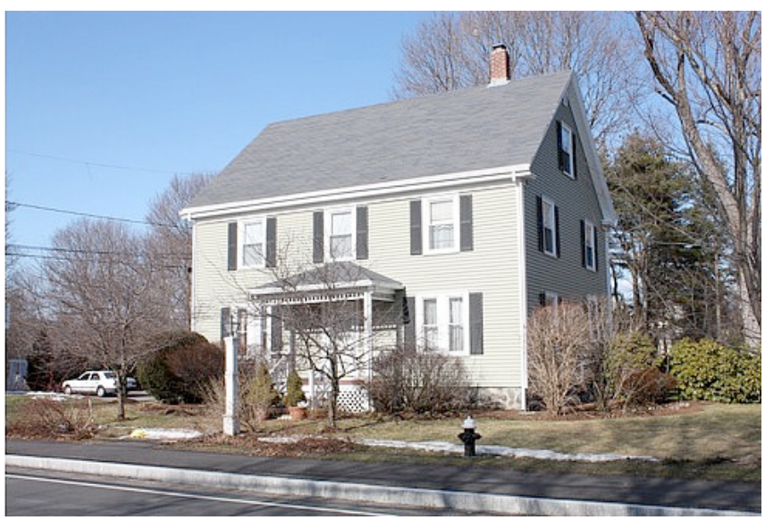
1 Utica Street