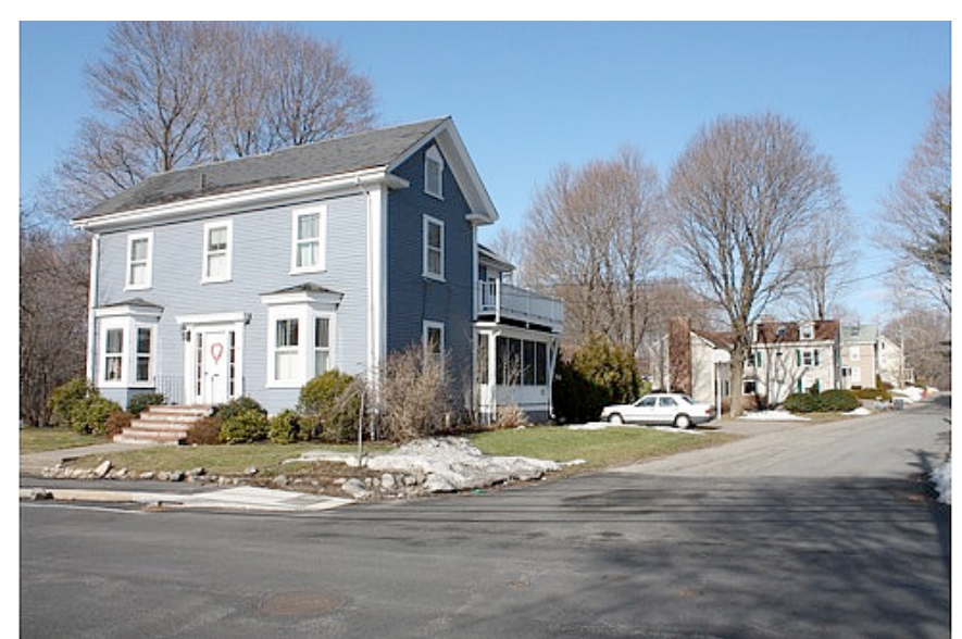
132 Woburn Street