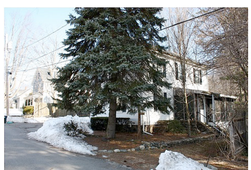
9 Utica Street