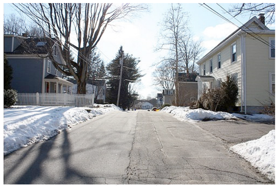
11 & 12 Utica Street