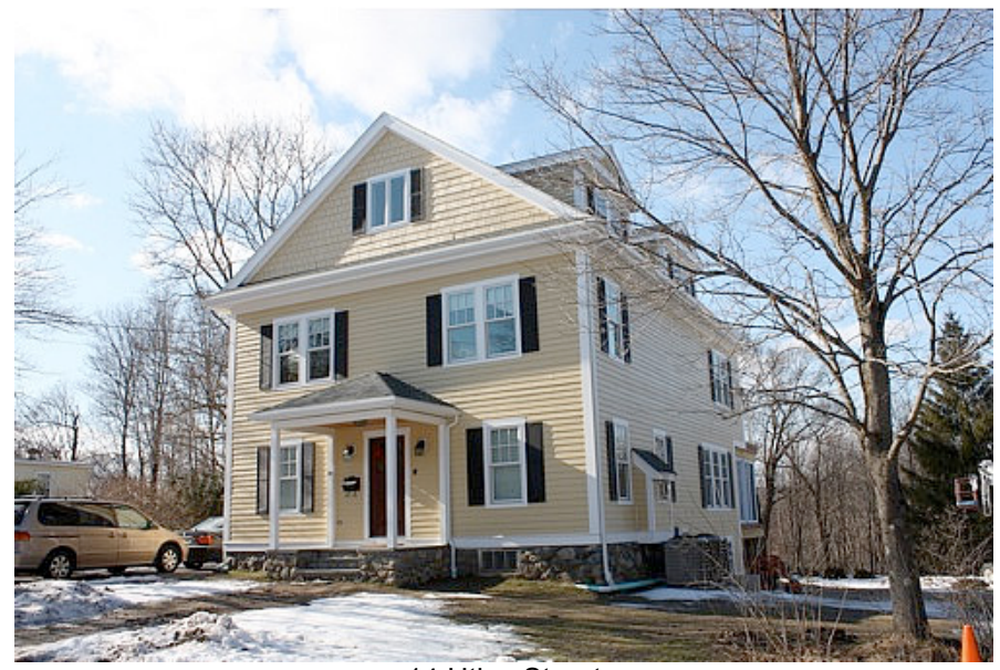
14 Utica Street