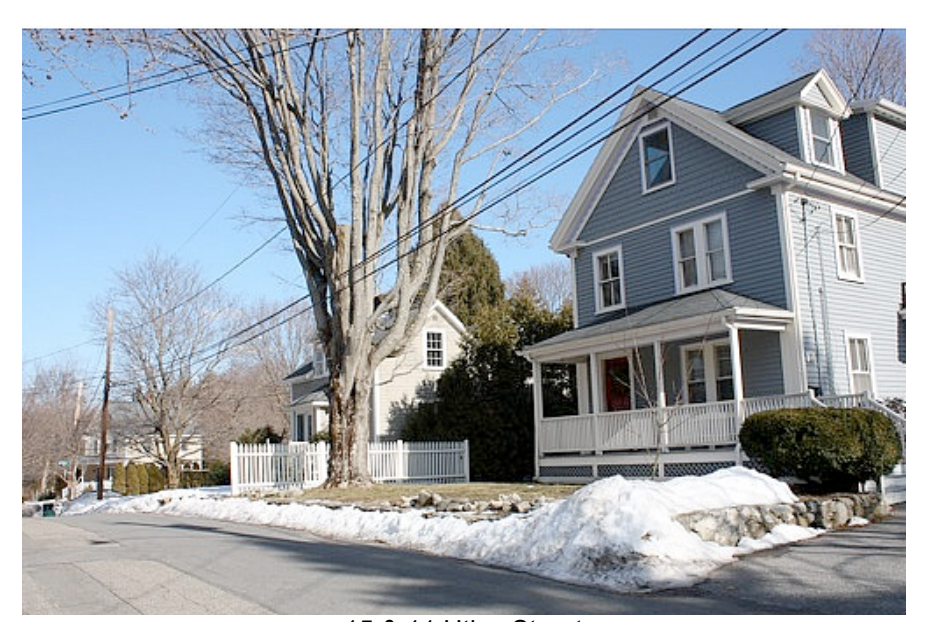
15 & 11 Utica Street