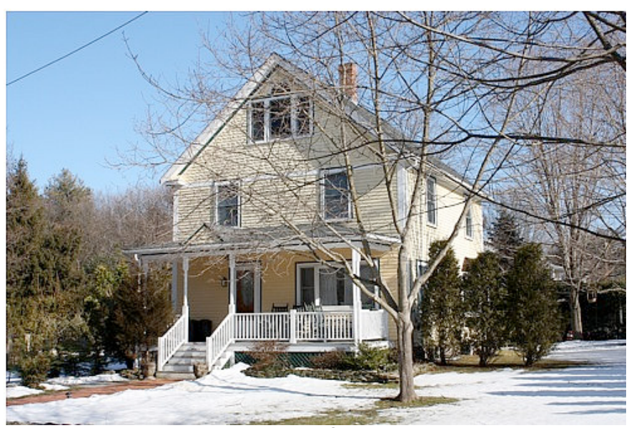
19 Utica Street

220 Morrissey Boulevard, Boston, Massachusetts 02125