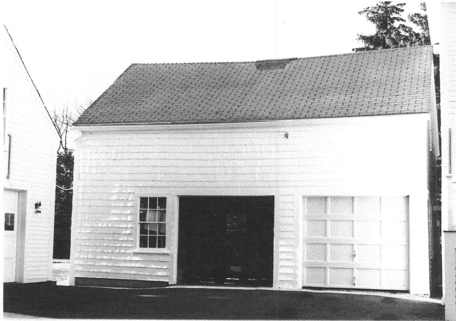
Roll #17, Negative #13