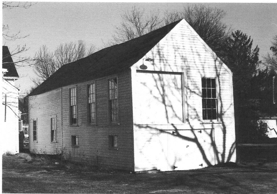
Roll #17, Negative #12