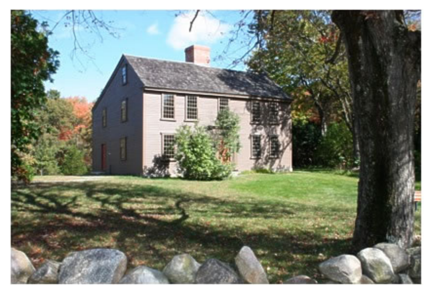
Jacob Whittemore House, Marrett Street

Other historic sites include "The Bluff", a small rocky hill at the intersection of Massachusetts and Old Massachusetts Avenues. At the base of the Bluff, on the Massachusetts Avenue side is a granite marker describing the British use of the Bluff as a rallying point. After a struggle with the Colonists, the British retreated to Fiske Hill where they were "driven in great confusion". The marker was originally mounted into the face of the Bluff but was relocated when part of the landscape was blasted about 1938 in order to widen the adjacent highway.