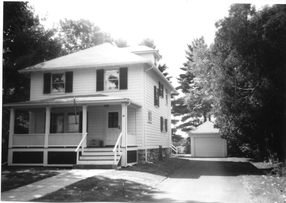
21 Parker Street