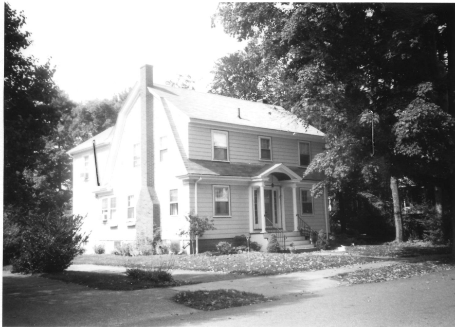
29 Parker Street