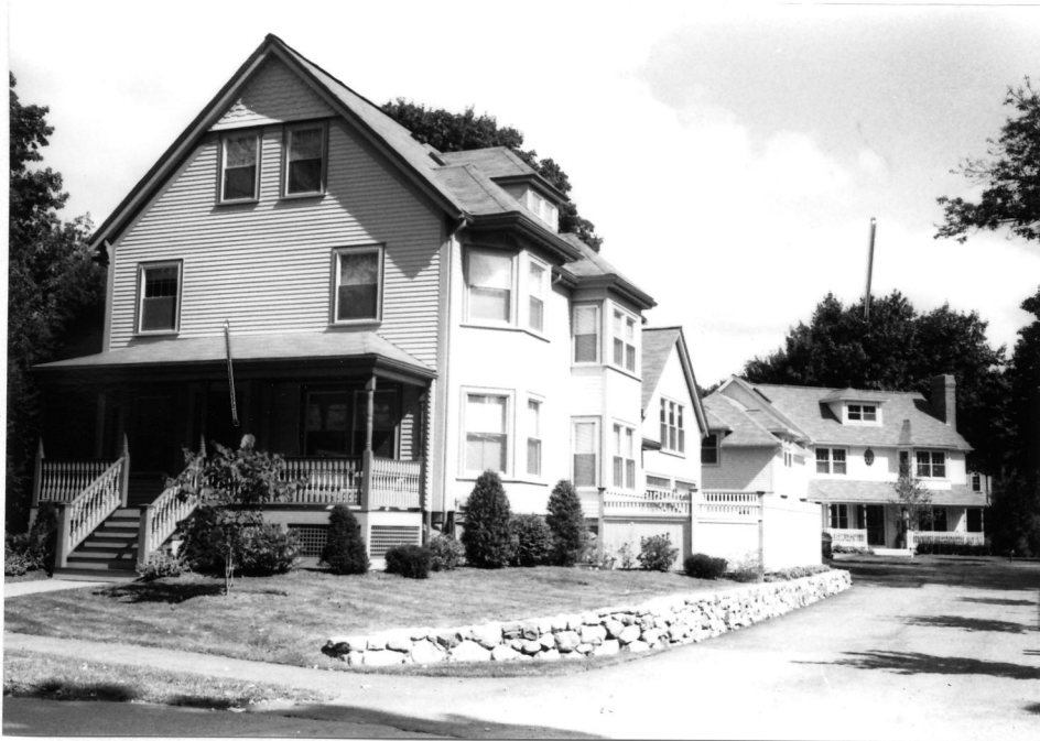
26 Parker Street