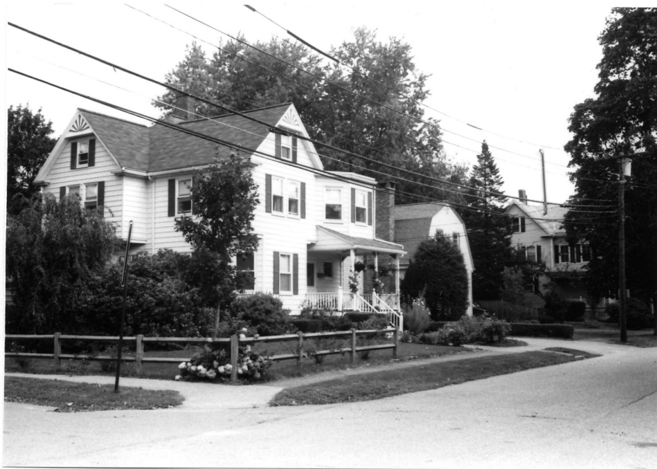
view down Clarke Street