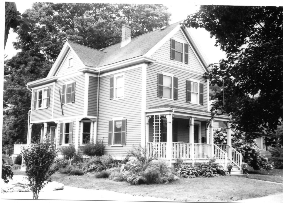
33 Parker Street