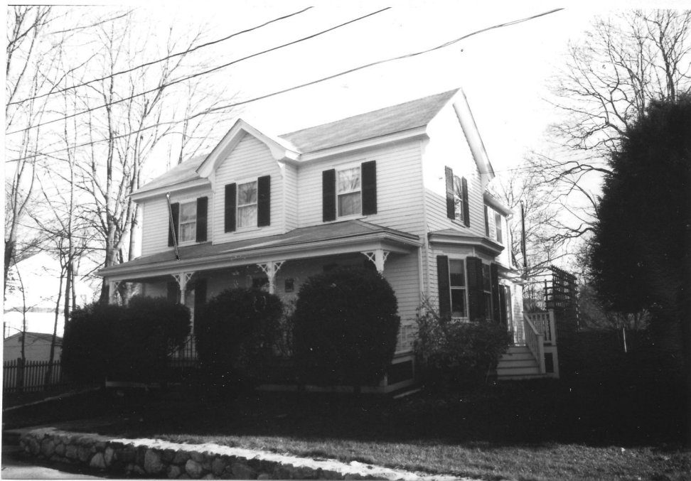
9 Jackson Court