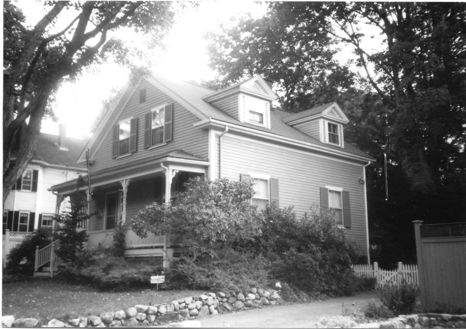
5 Jackson Court