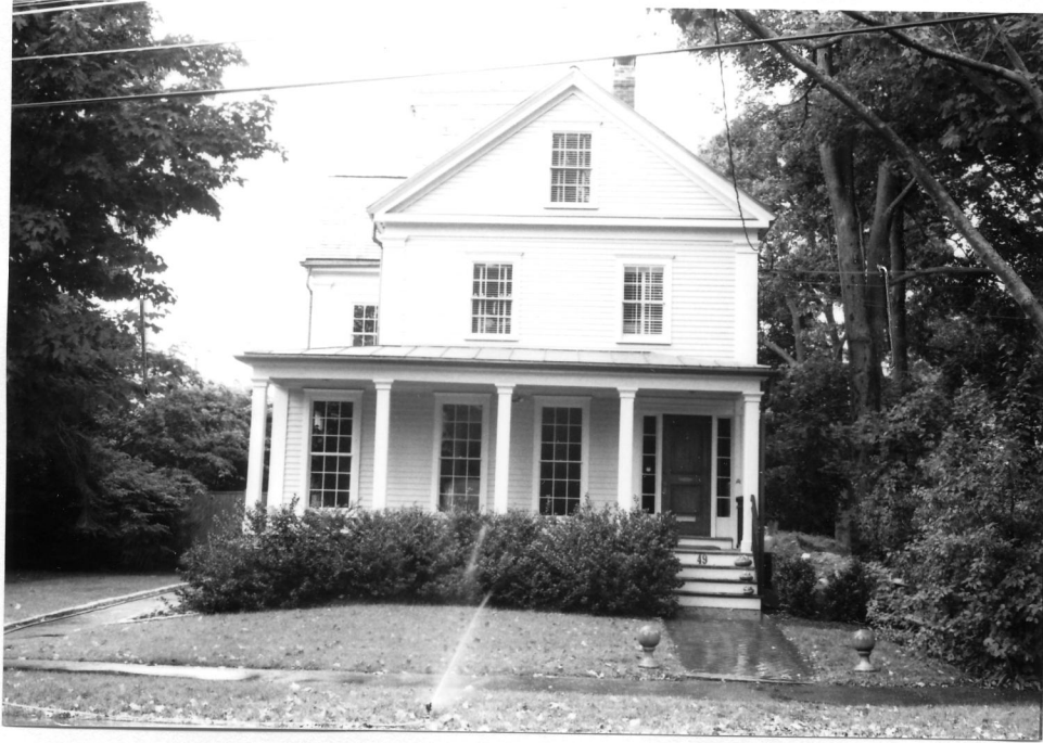
49 Parker Street