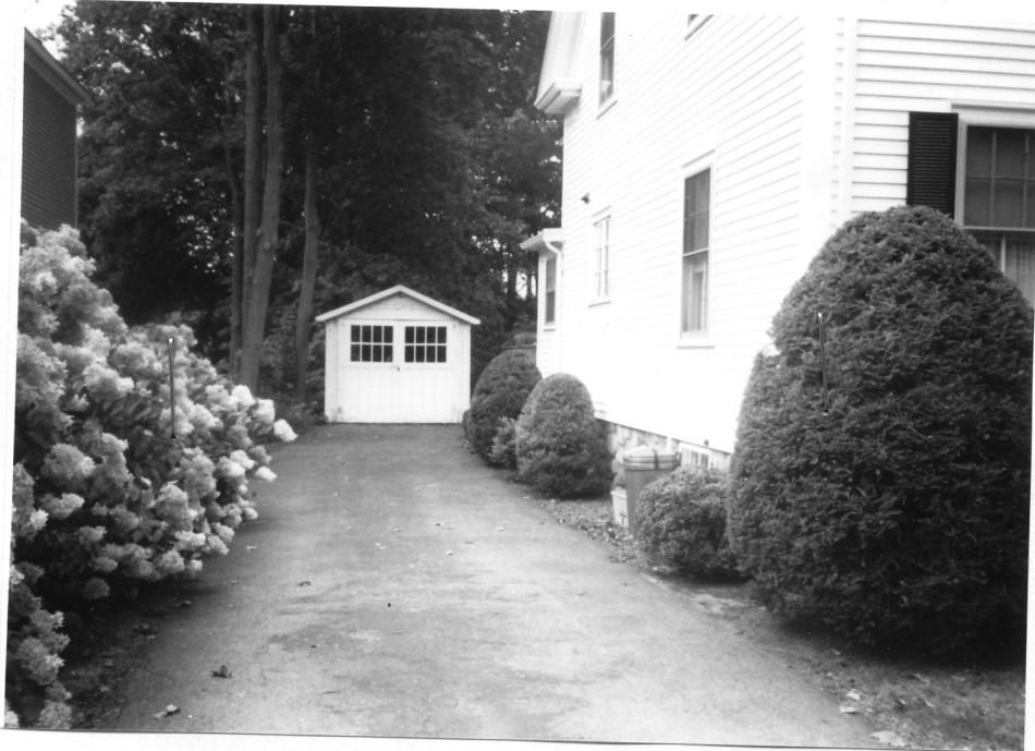
45 Parker Street