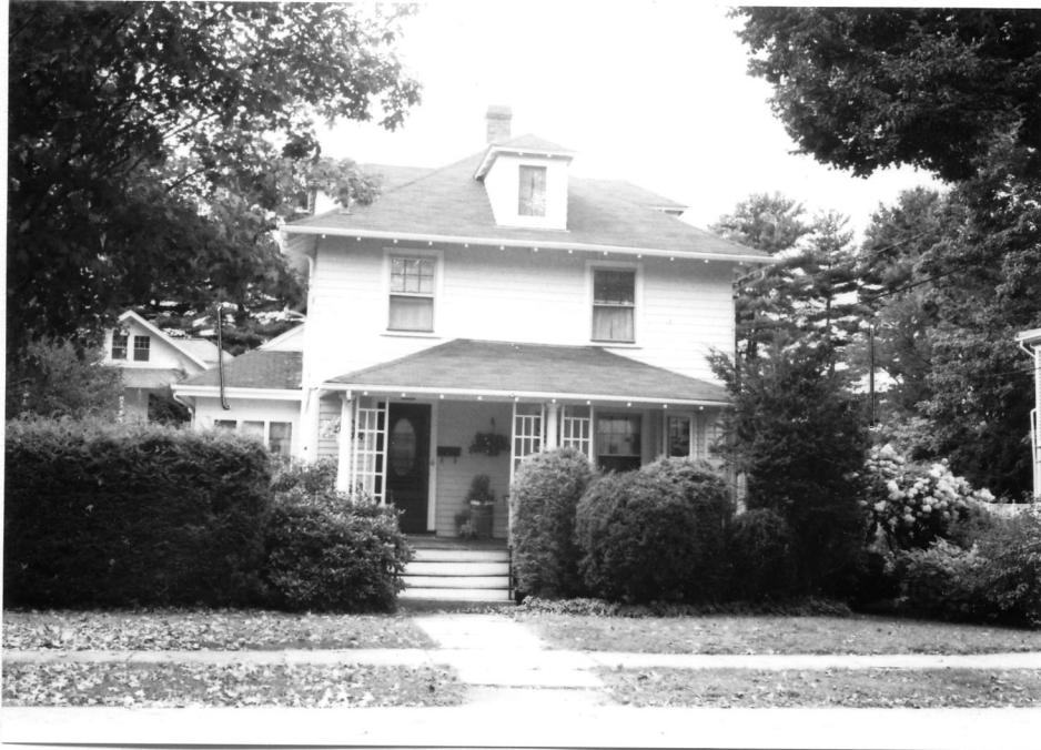
35 Parker Street