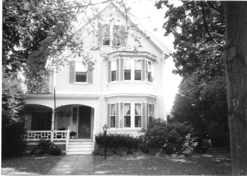
20 Parker Street