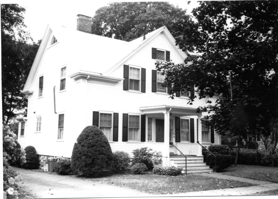
45 Parker Street