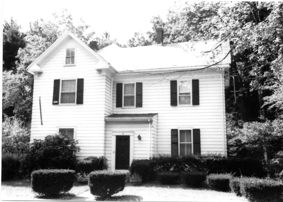
5 Parker Street