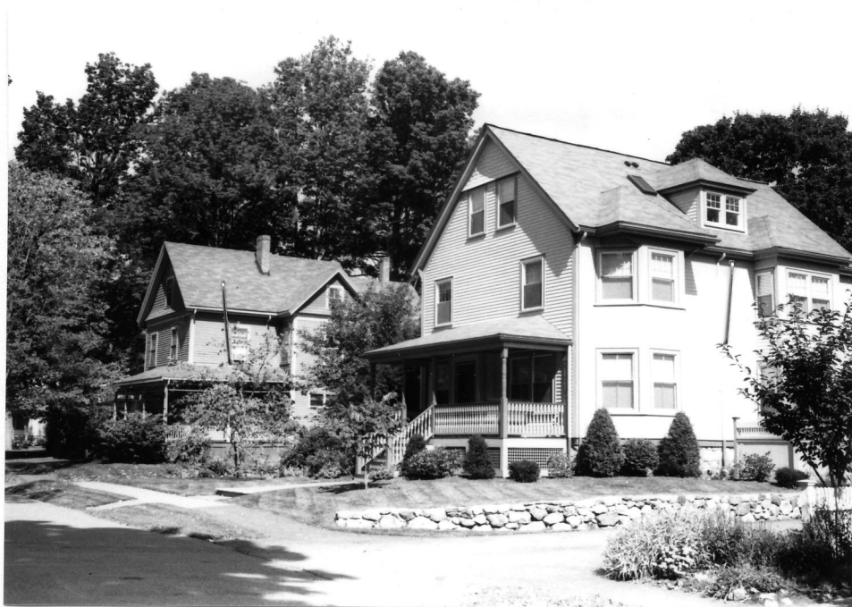
24 & 26 Parker Street