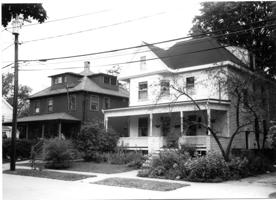
38 & 40 Parker Street