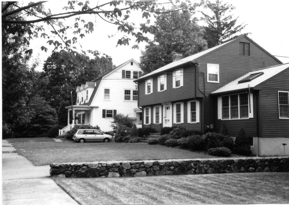
34 & 36 Clarke Street