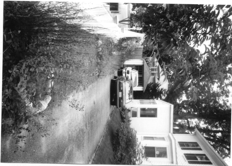
30 Parker Street