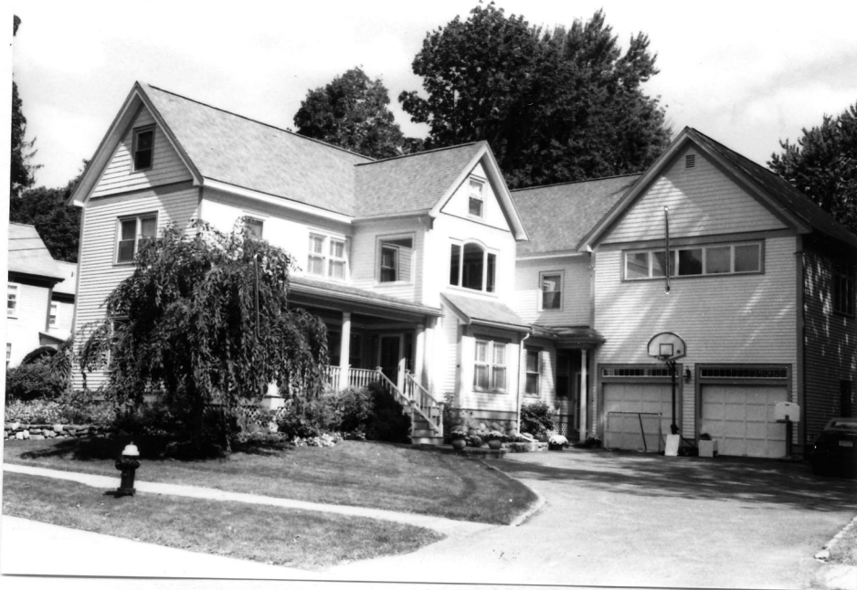
16 Parker Street