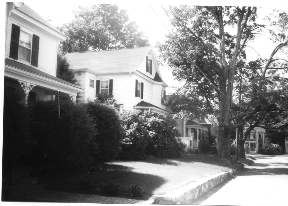
view down Jackson Court toward Parker Street