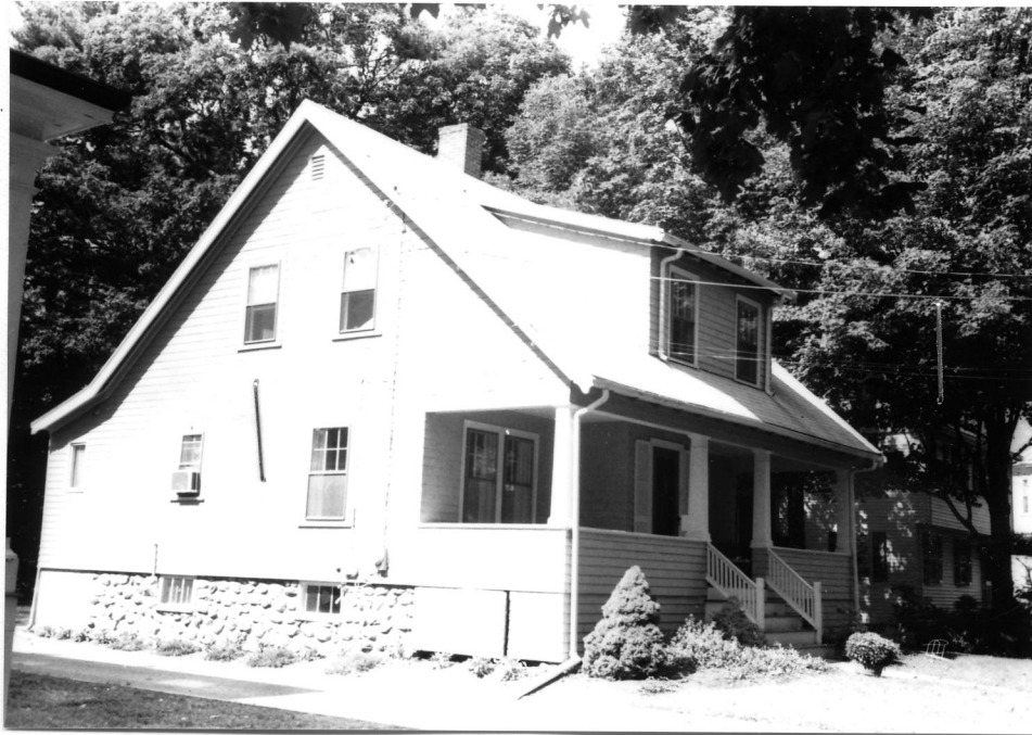
11 Parker Street