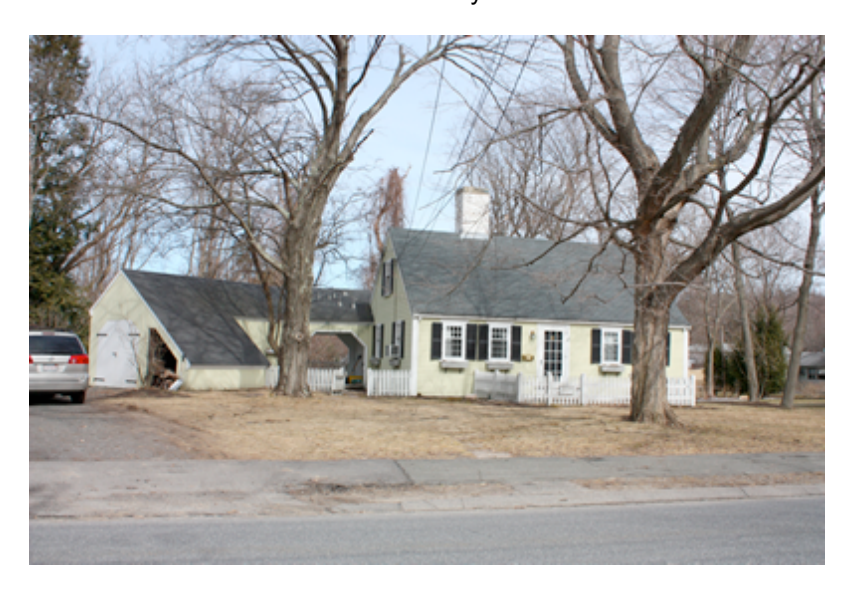
2627 Massachusetts Avenue