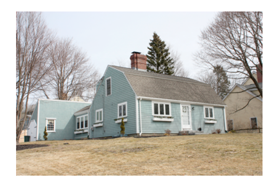
2663 Massachusetts Avenue