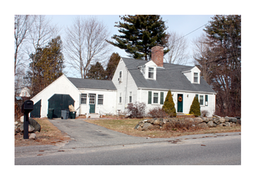
10 Paul Revere Road