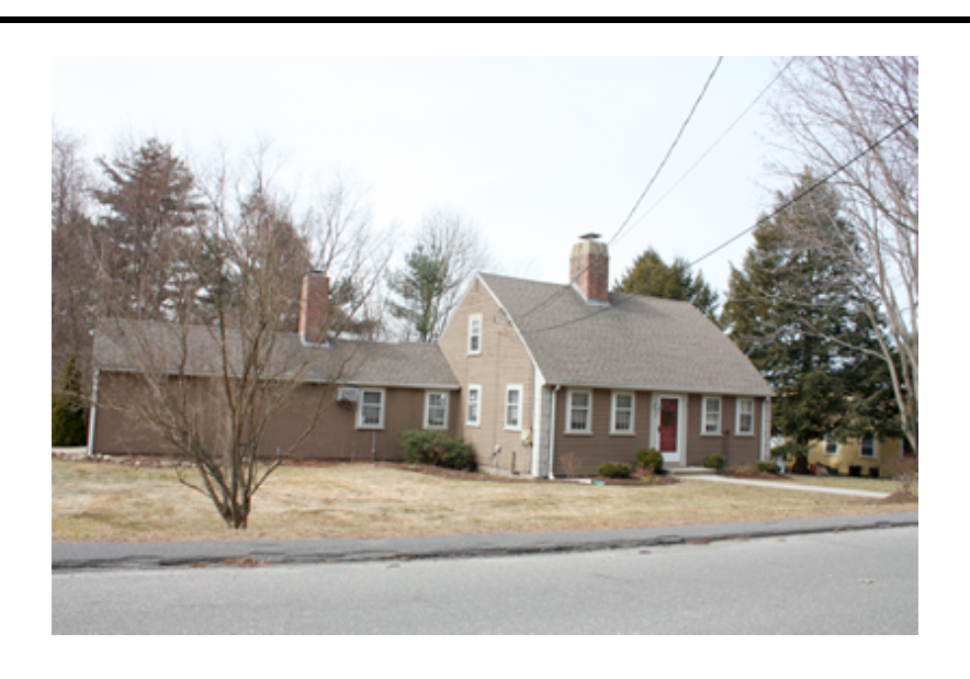
2 Constitution Road