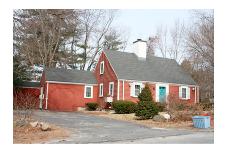
12 Paul Revere Road