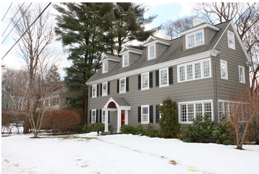
28 Slocum Road