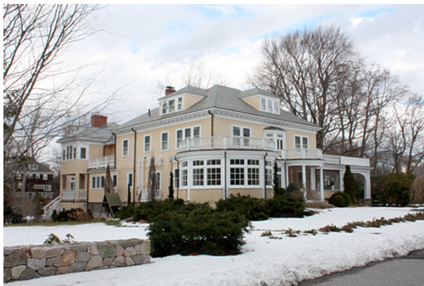
19 Slocum Road