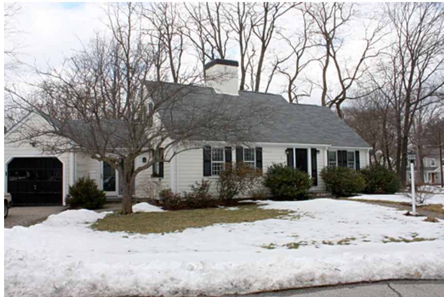
15 Slocum Road