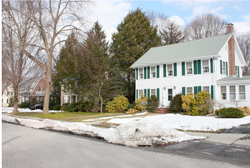
18 & 20 Highland Ave.