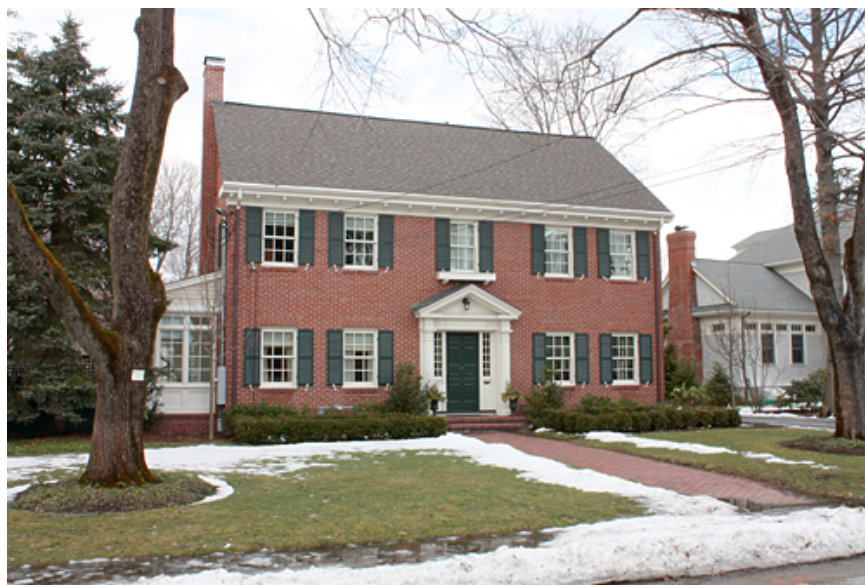
27 Slocum Road