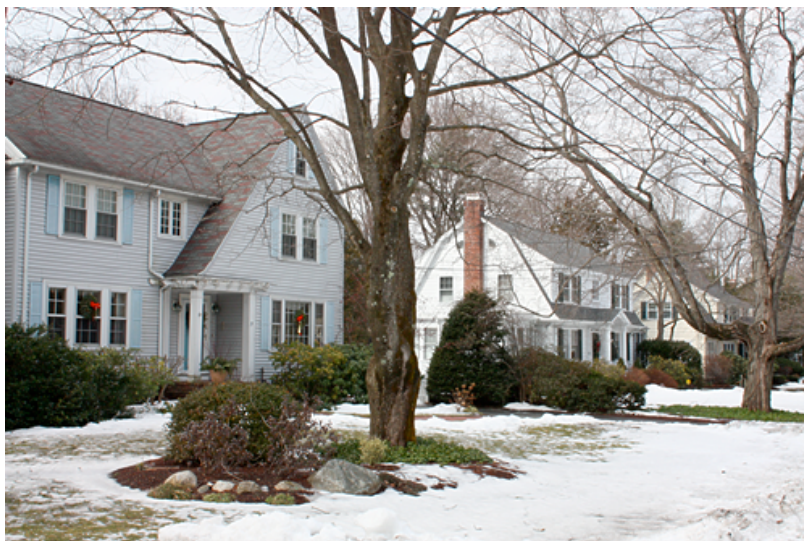
19 & 17 Highland Ave.