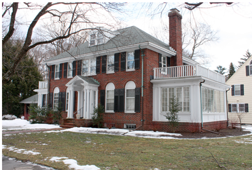
32 Slocum Road