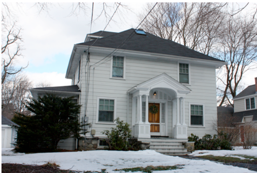
73 Bloomfield St.