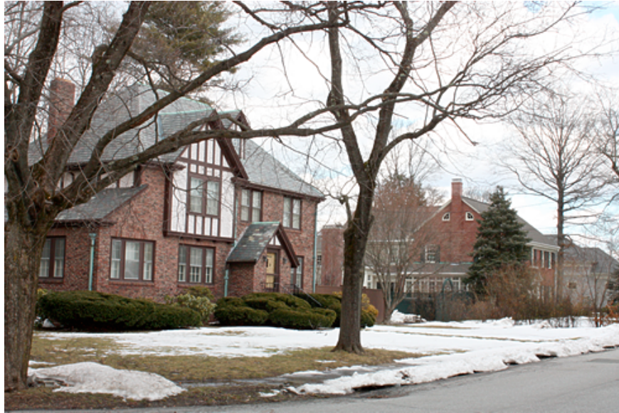
31 & 27 Slocum Road