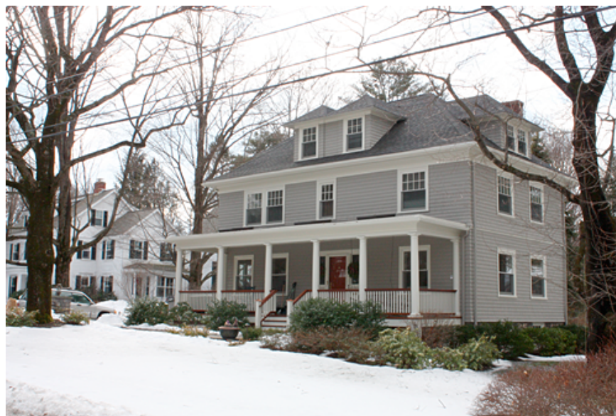
25 Highland Ave.