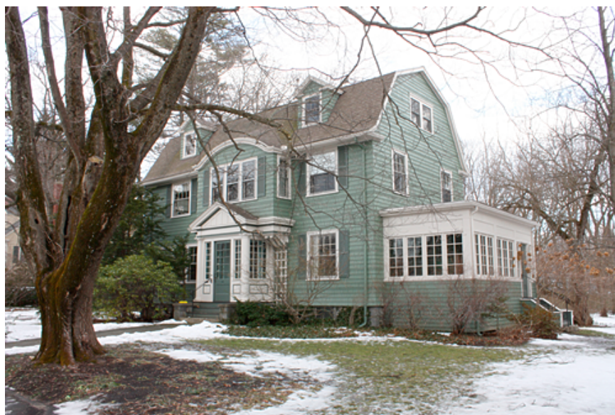
22 Slocum Road