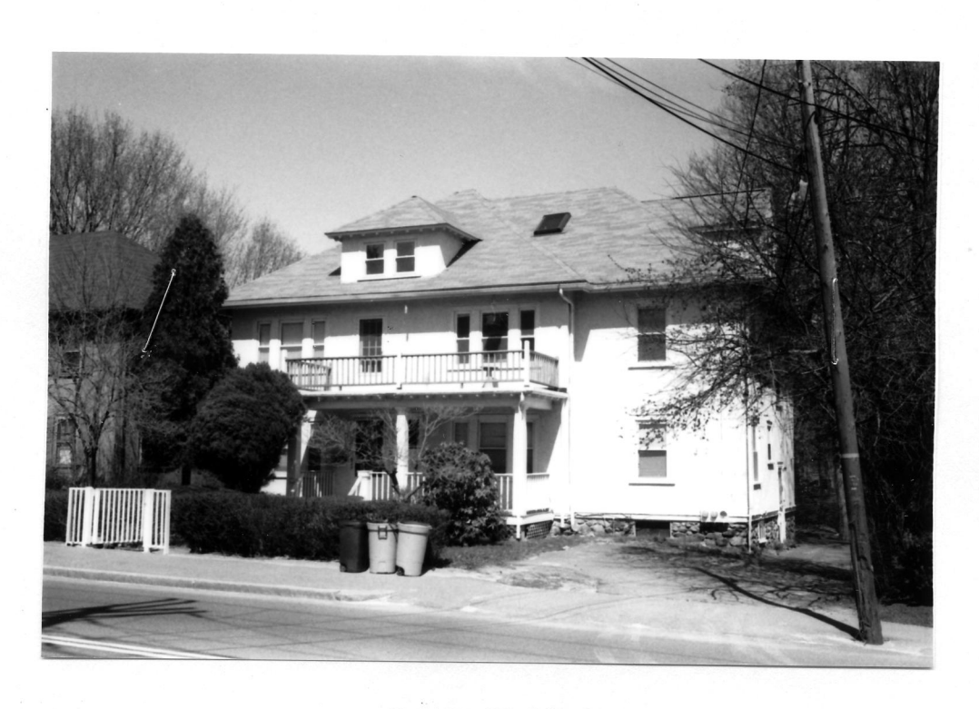
69-71 Bedford Street