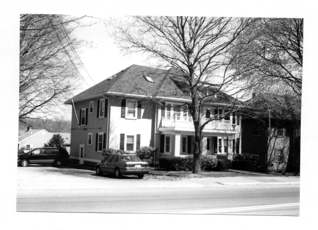
81-83 Bedford Street