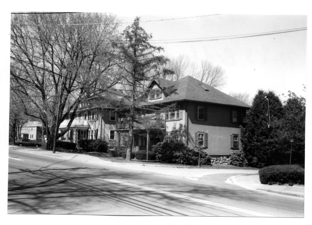
77-79, 81-83 Bedford Street