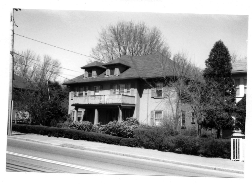
73-75 Bedford Street