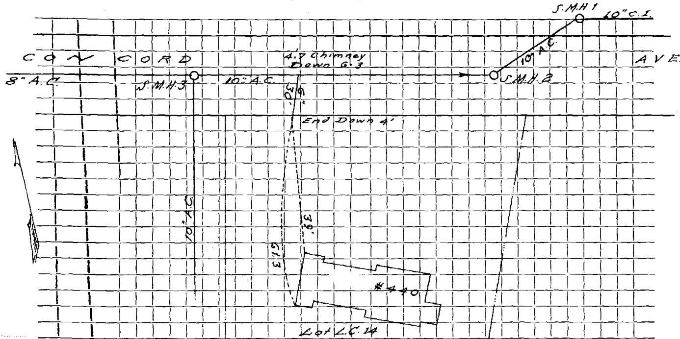
Sketch of Service Here