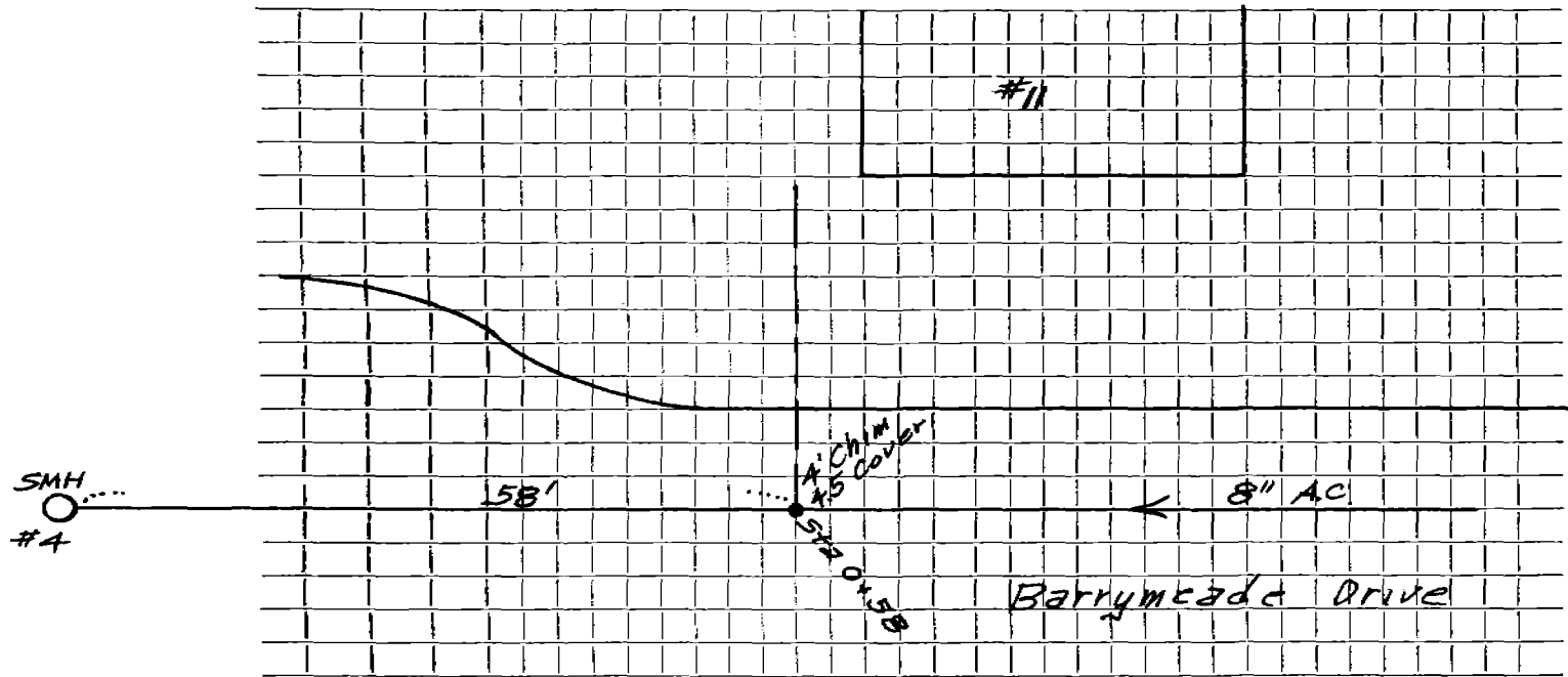
Sketch of Service Here