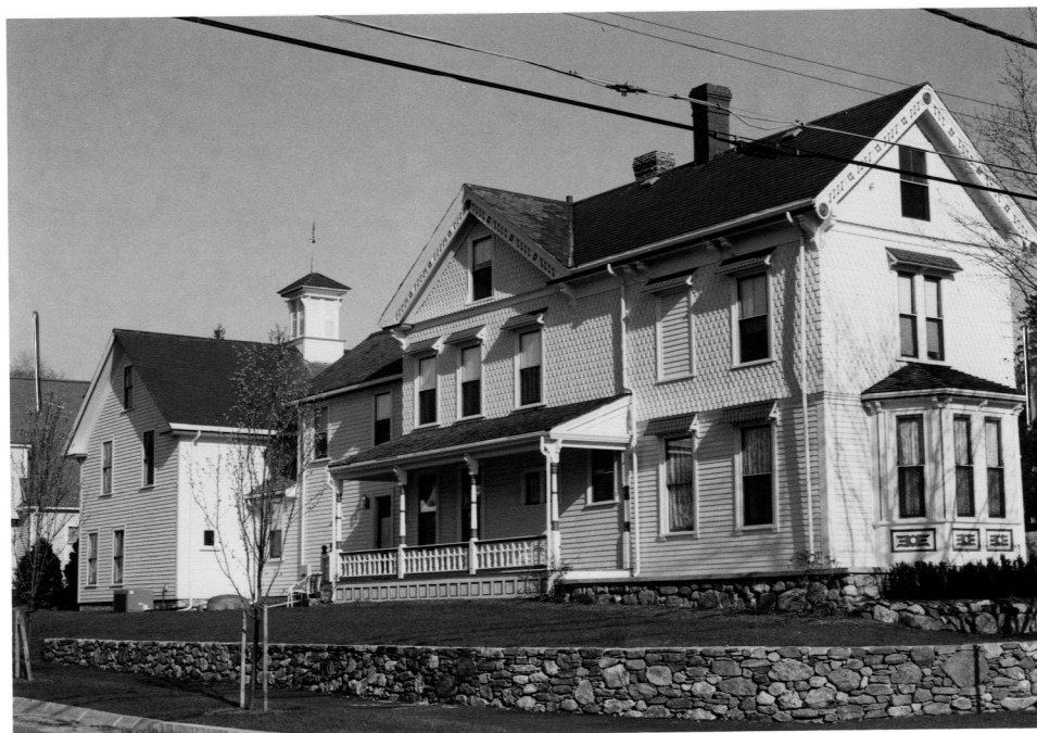
Roll #8, Negative #36A-37