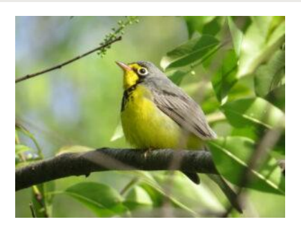
Birding Lower Vine Brook SATURDAY MAY 7: 8-10 AM