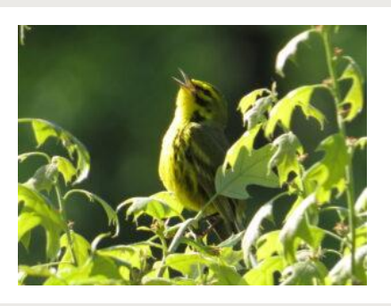
Birding Paint Mine SUNDAY MAY 8: 7-9 AM

617-461-9500, <u>hwest2020@gmail.com</u>