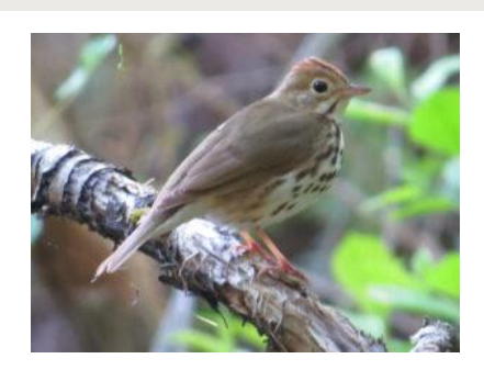
Peak Migration Birding at Dunback Meadow SATURDAY MAY 21: 7-9 AM