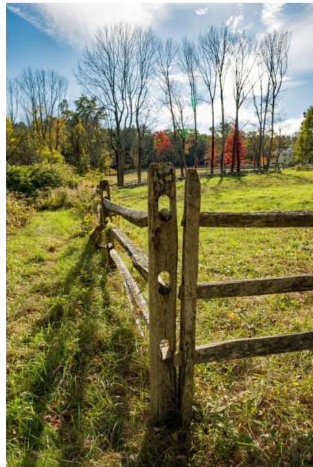
Wright Farm in Autumn; Photo by Dick Wolk