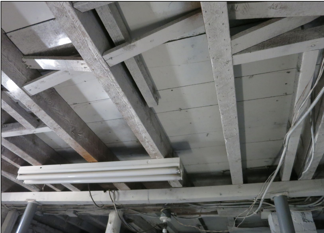
Basement, first-floor floor structure under SW parlor.