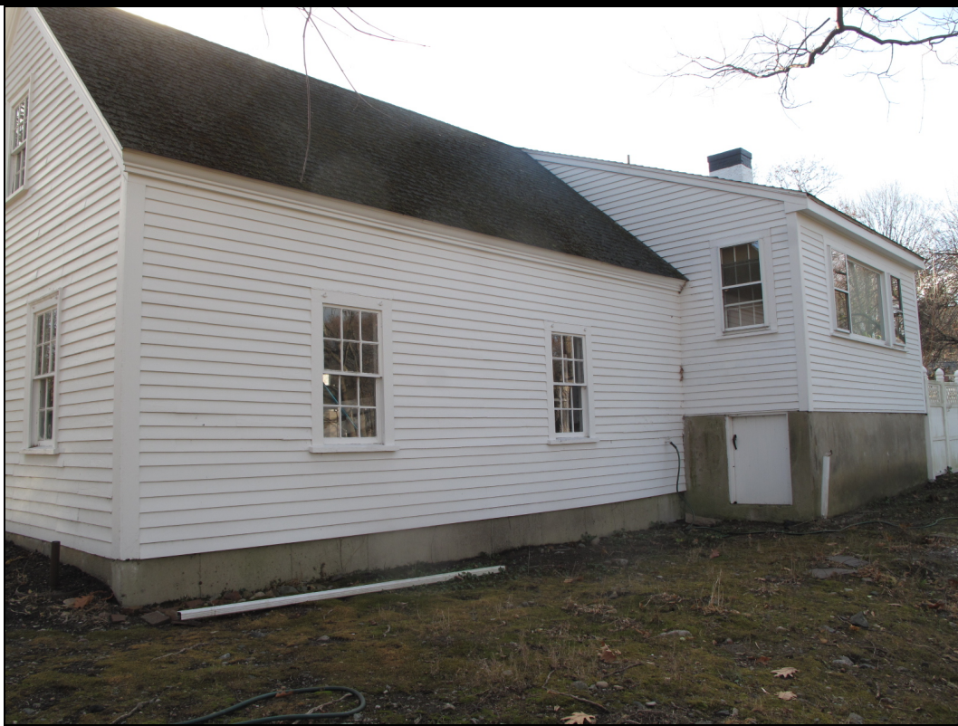
View of additions from SE