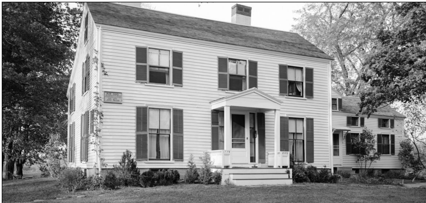
Historic view from west, ca. 1960.