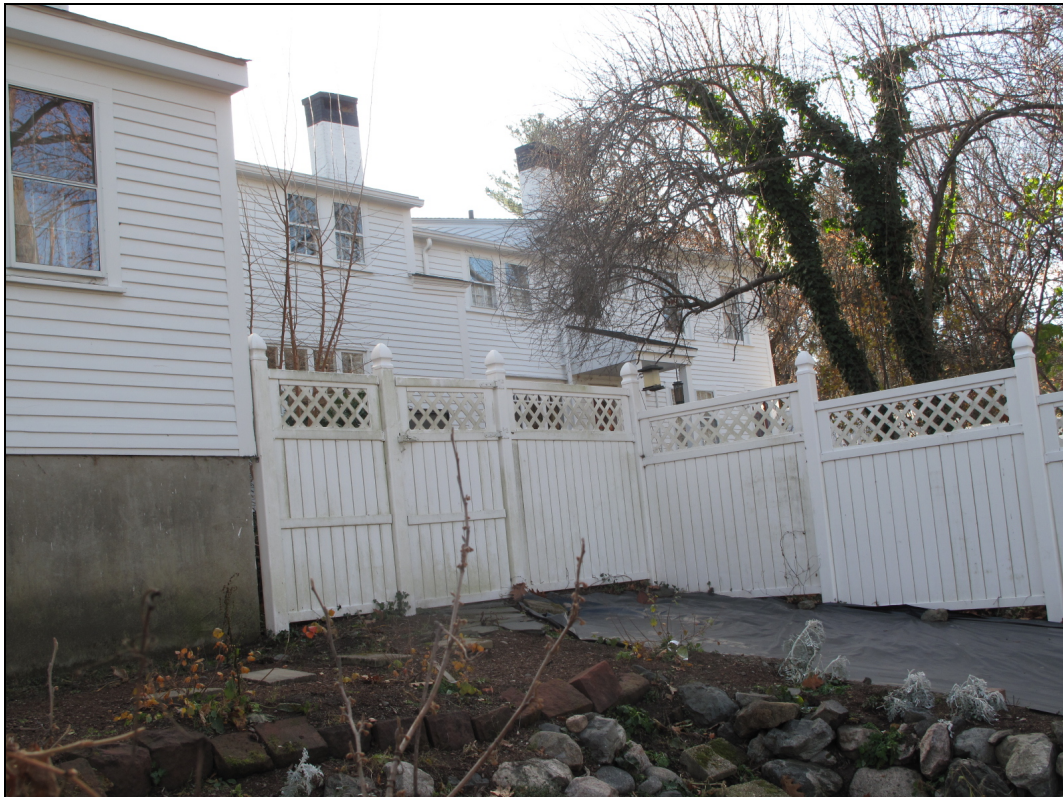
View of house and wing from SE.