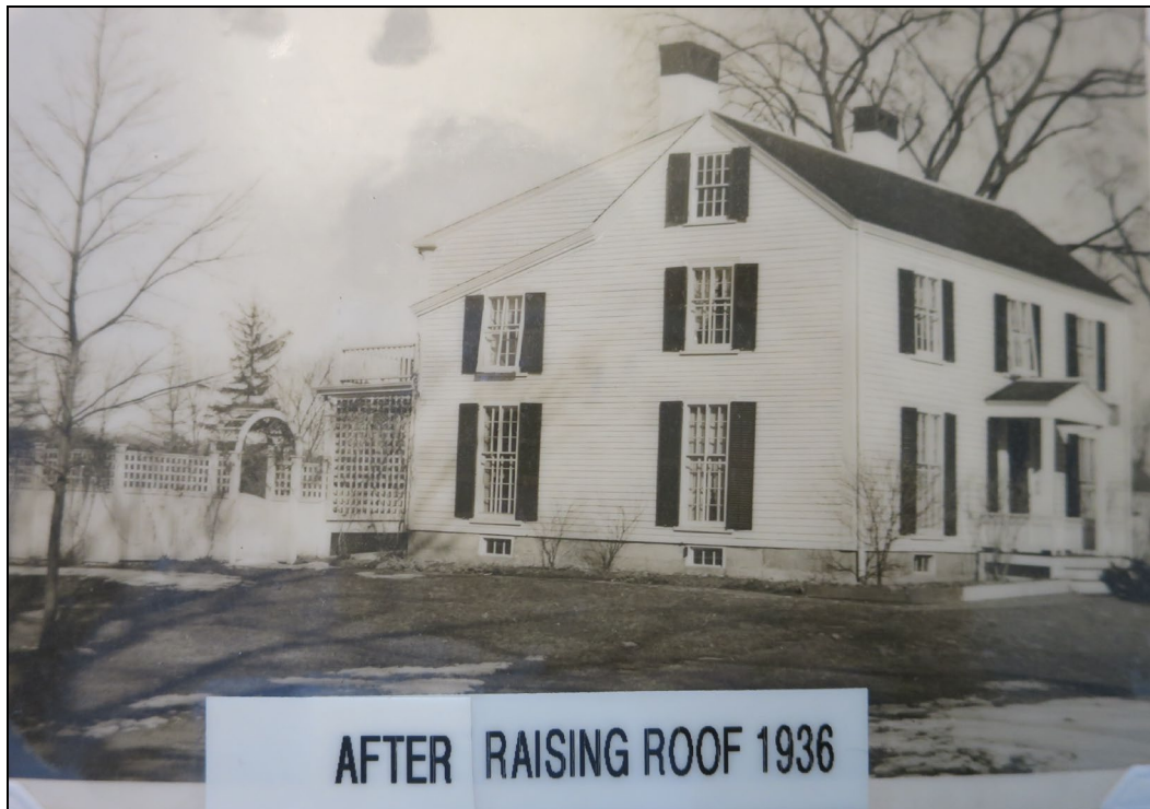
Snapshot view from NW, 1936.