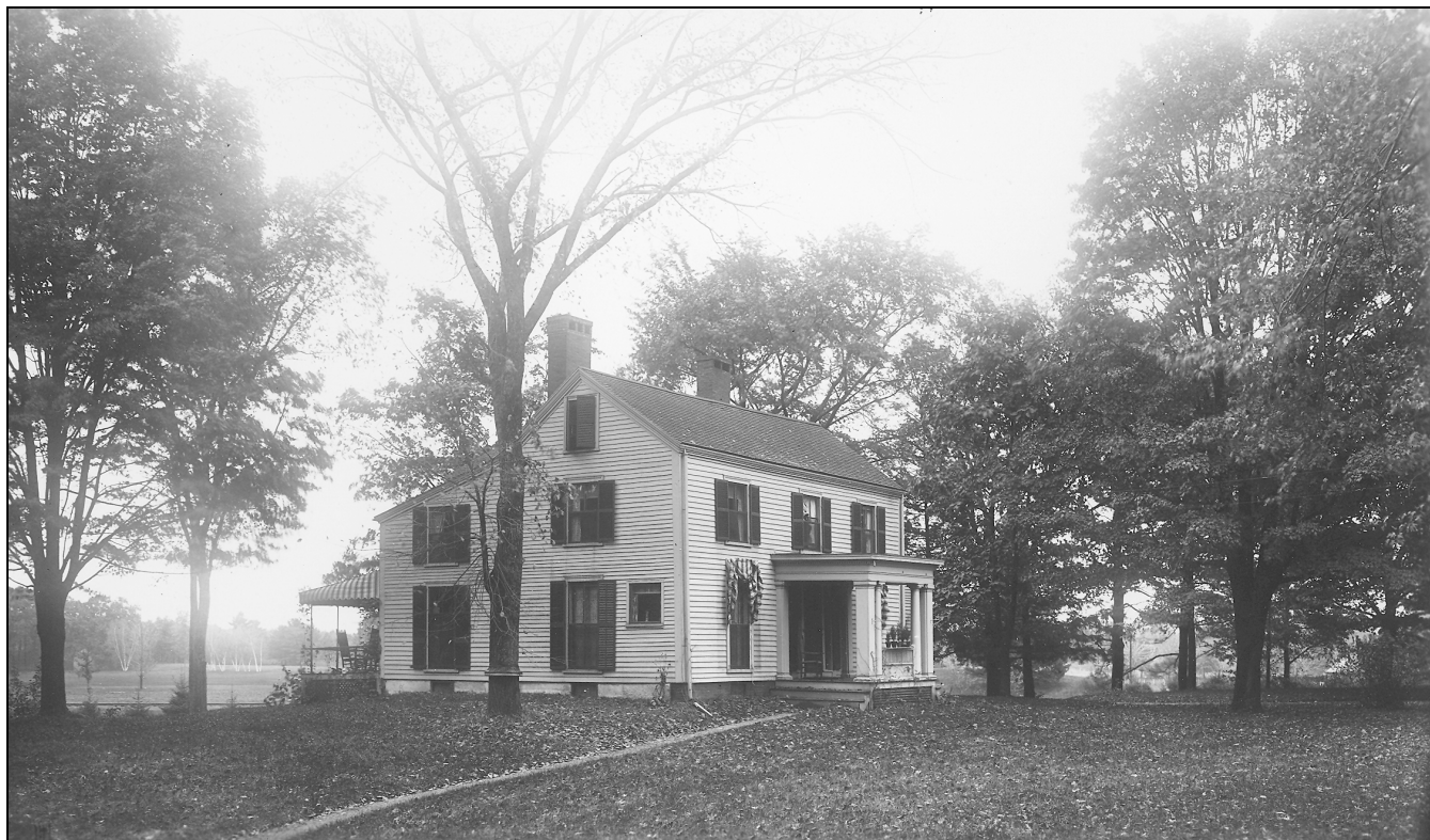
Historic view from NW, ca. 1930.