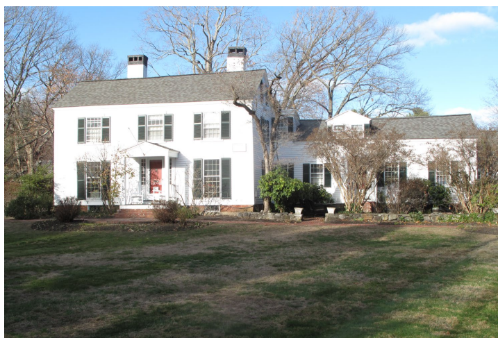
View from SW.