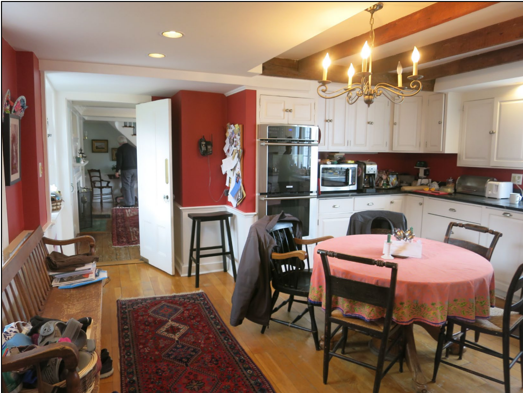
Kitchen looking north into dining room.