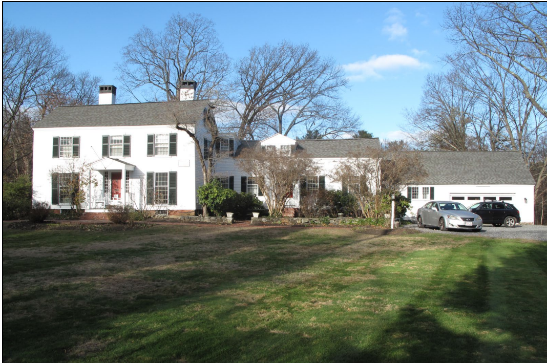
View from west.