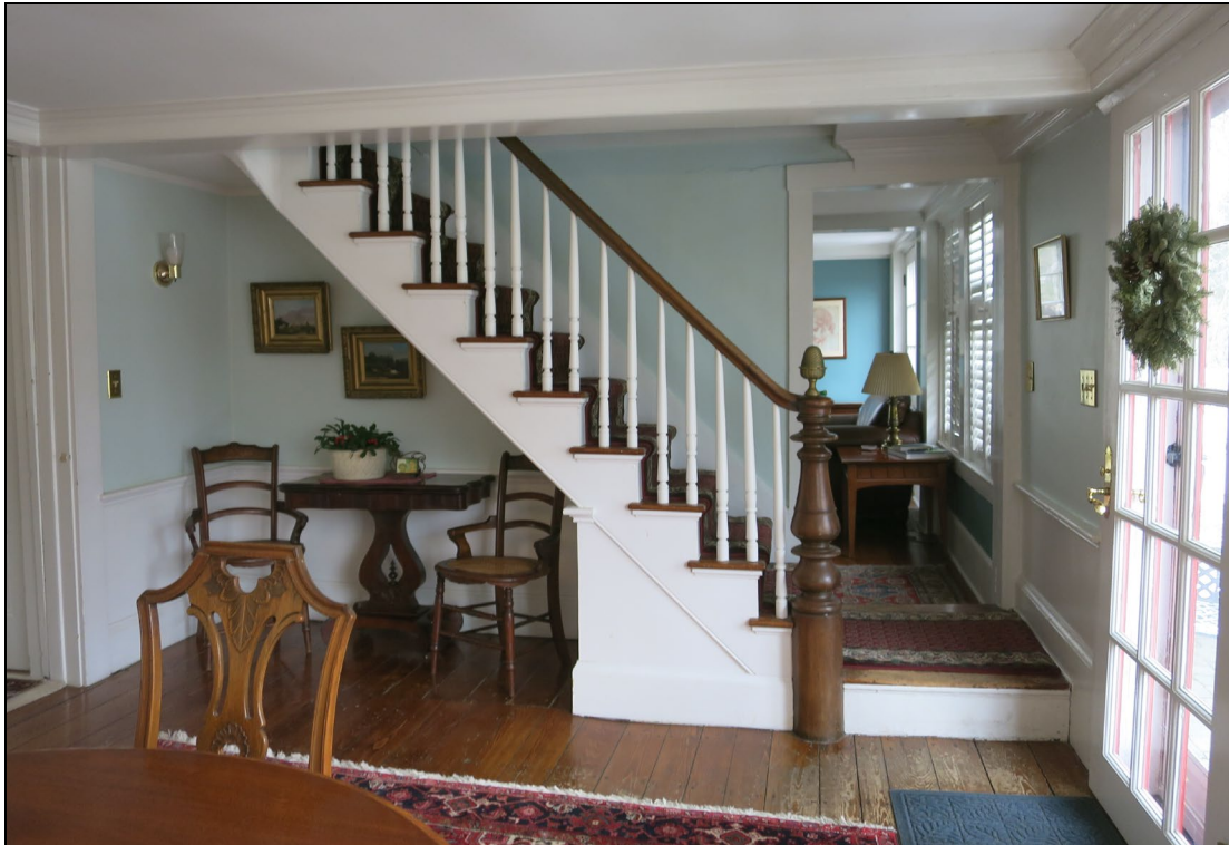
Staircase in rear saltbox looking north.