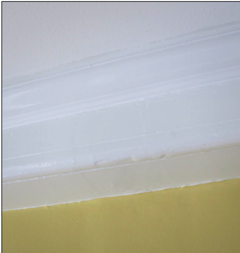
Detail of quirk bead on girt in east wall of southeast parlor.