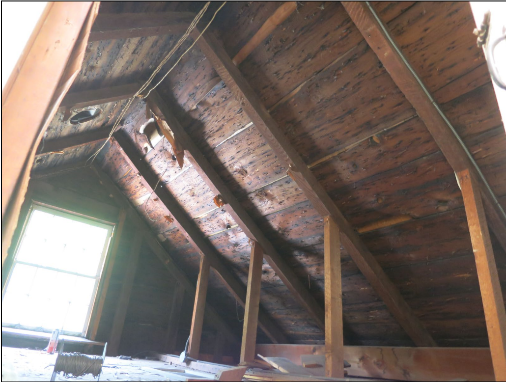
Attic, roof structure, common rafters looking SW.