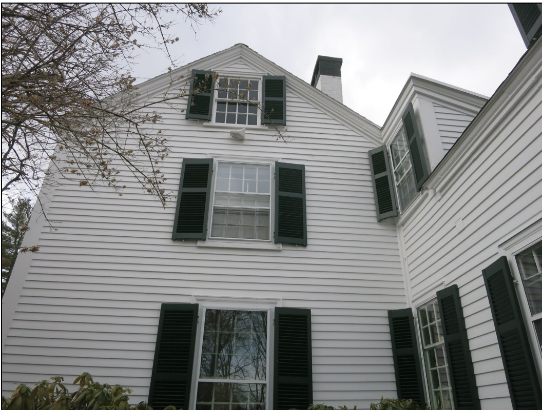
View from south.