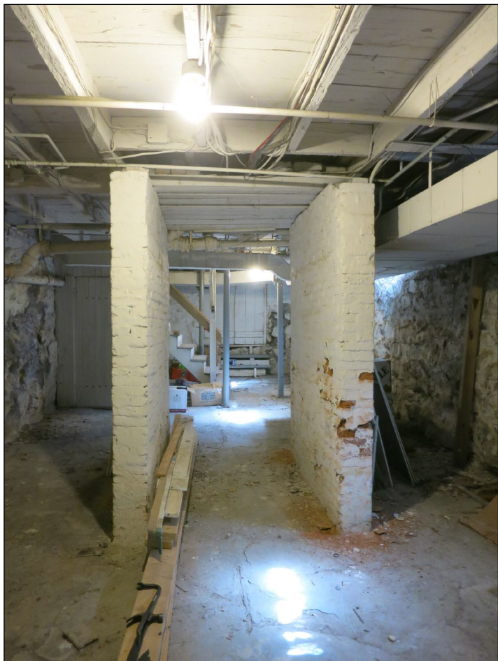
Basement, chimney base for kitchen hearth looking south.