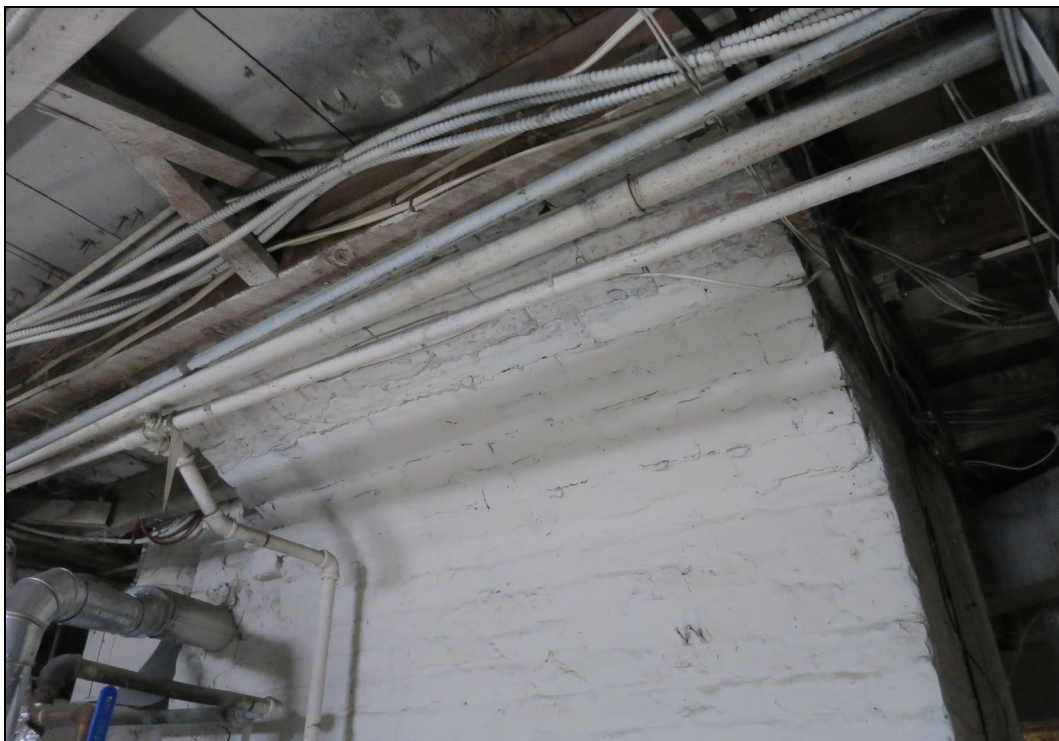
Basement, chimney base & hearth support for fireplace in SW parlor.