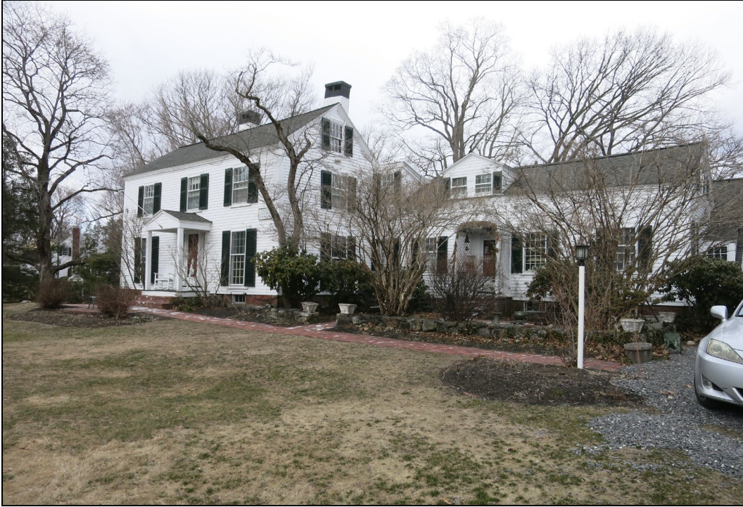
View from SW.