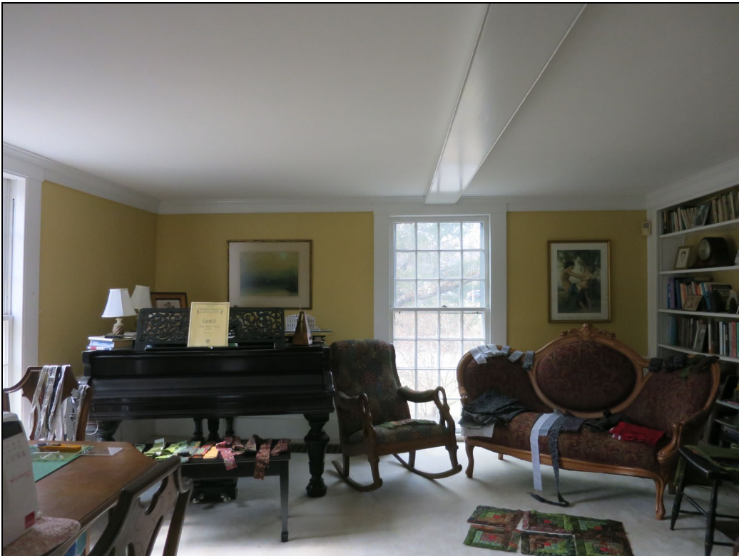
NW parlor looking north.