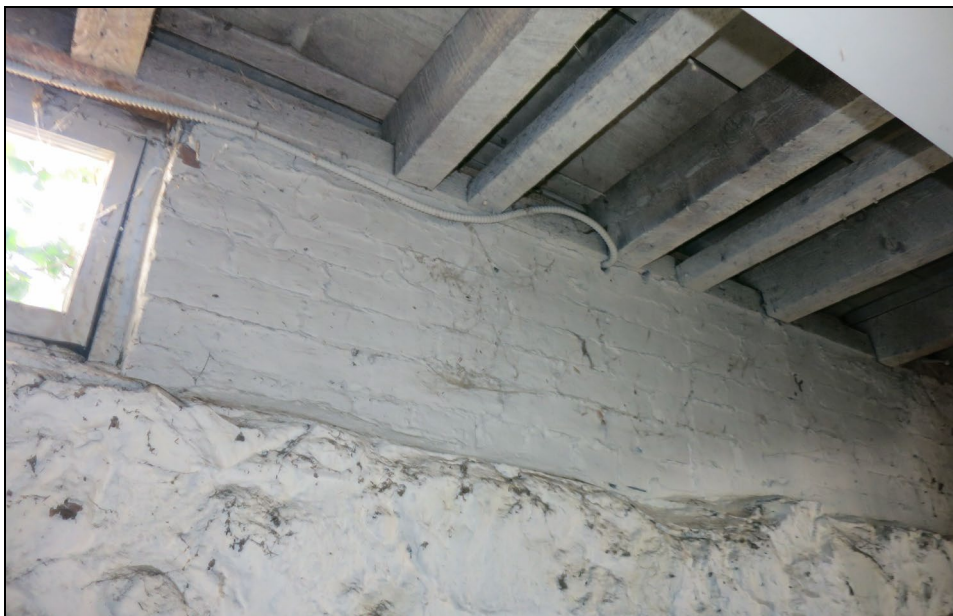
Basement, brick cap to foundation.