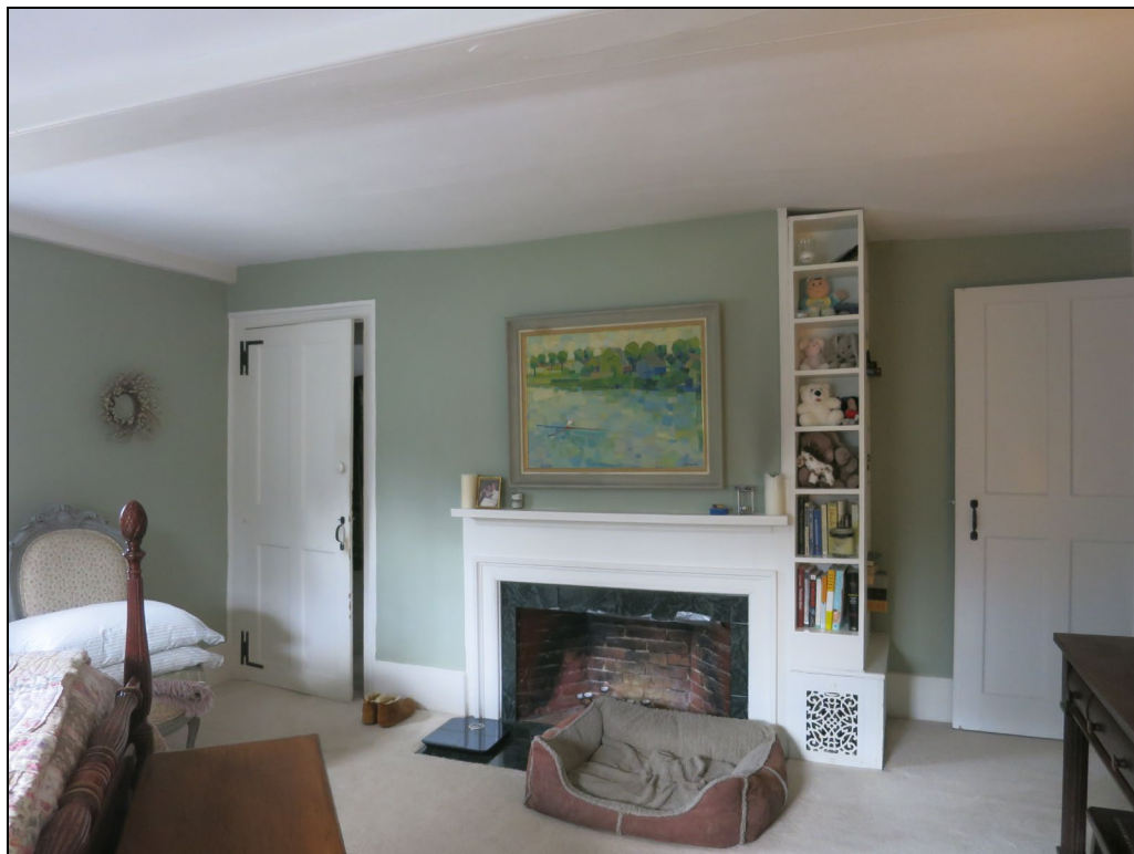
Second floor, NW chamber looking east.