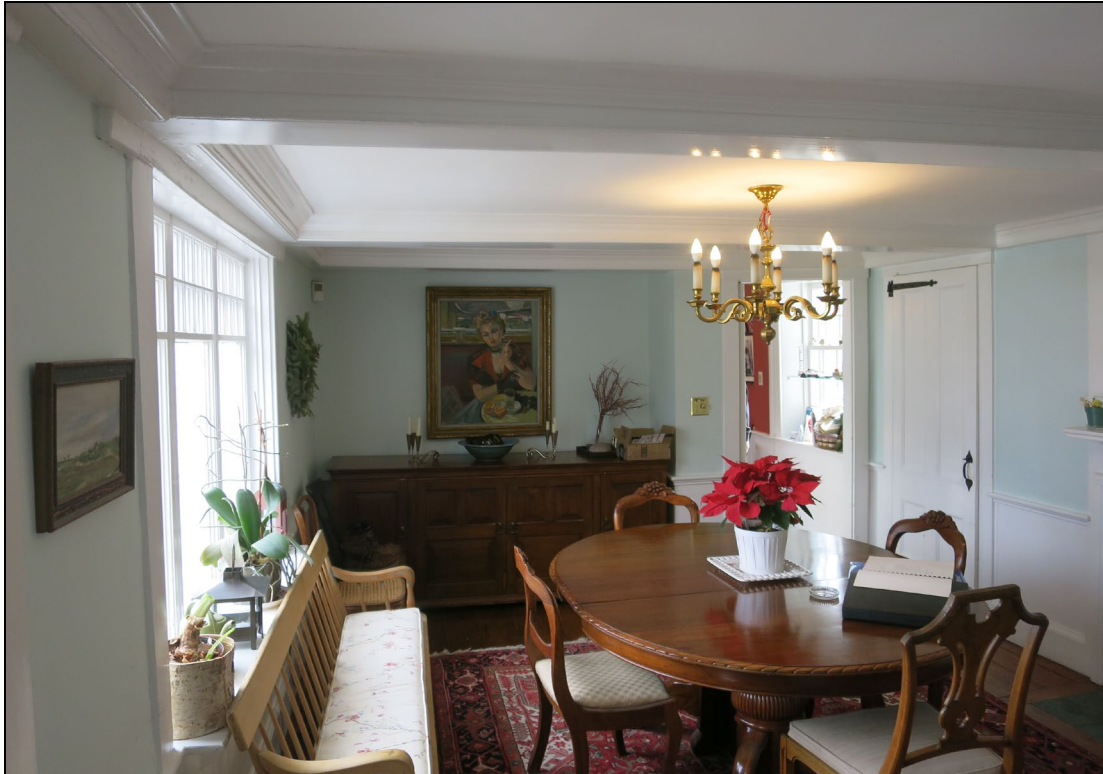
SE dining room looking south.