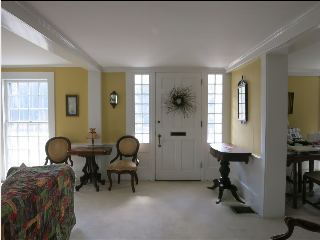
Front entrance looking west.