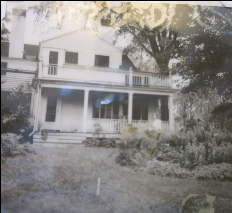
Snapshot of rear of house, n.d., showing porch and dormer since removed.