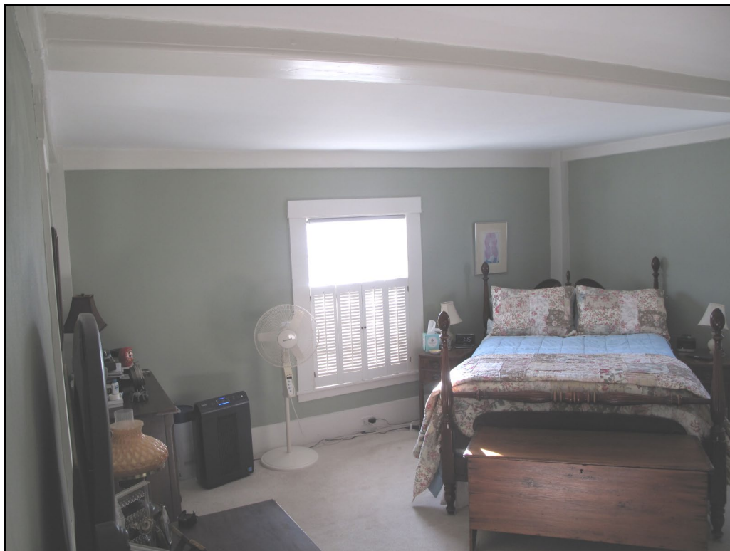
Second floor, NW chamber looking NW.