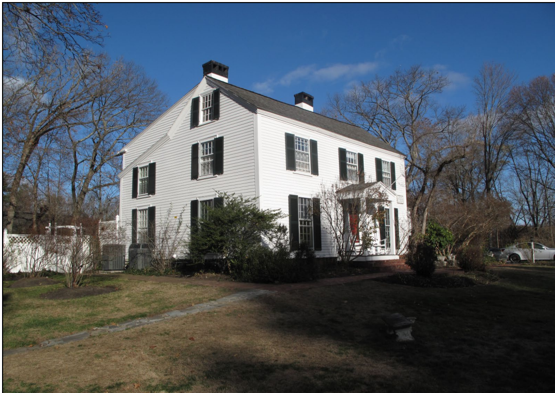
View from NW.