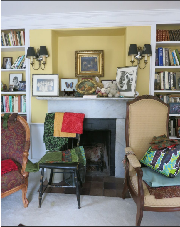
Detail of chimneybreast NW parlor.