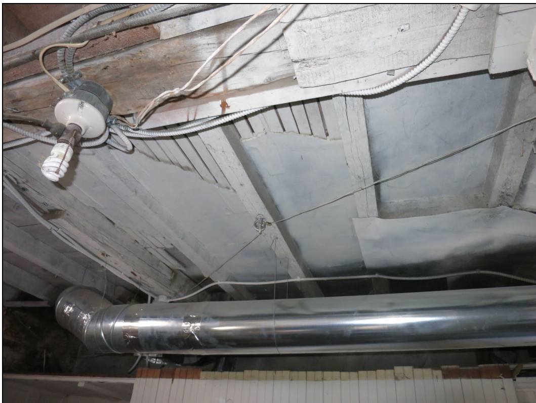
Basement, ceiling in SW corner showing plaster infill.