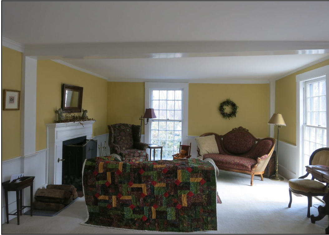
SW parlor looking south.