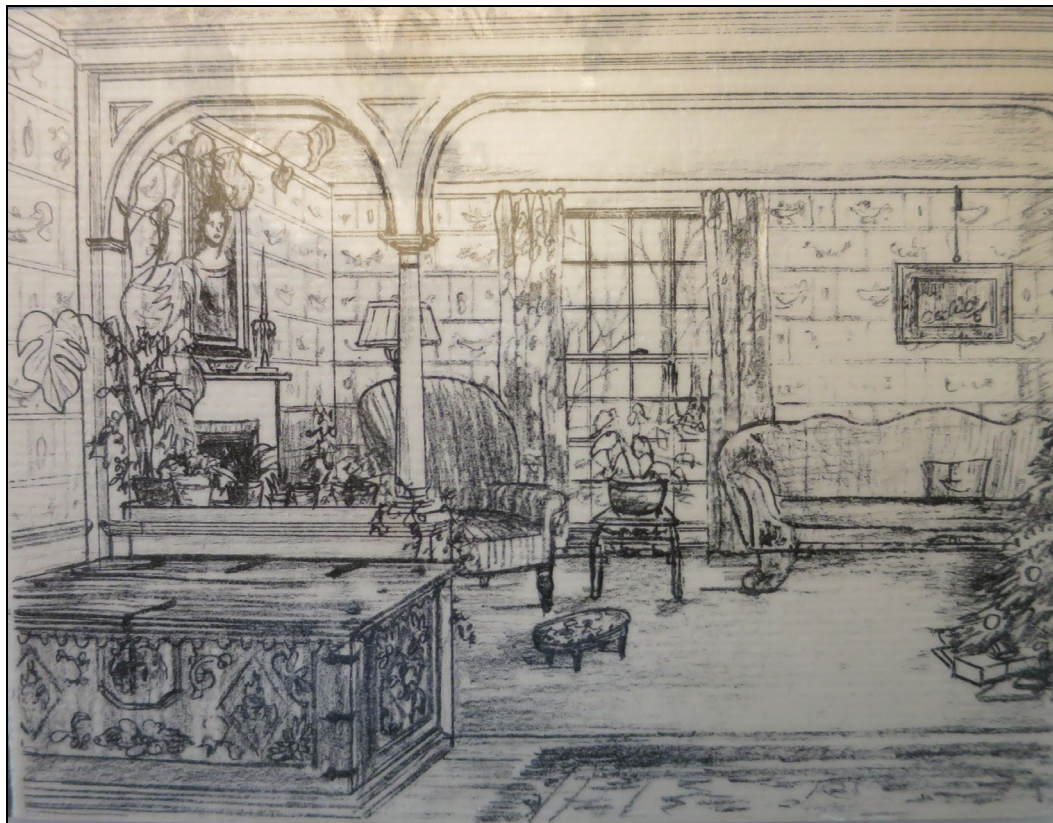
Drawing of front rooms with arcade on south side of passage space.