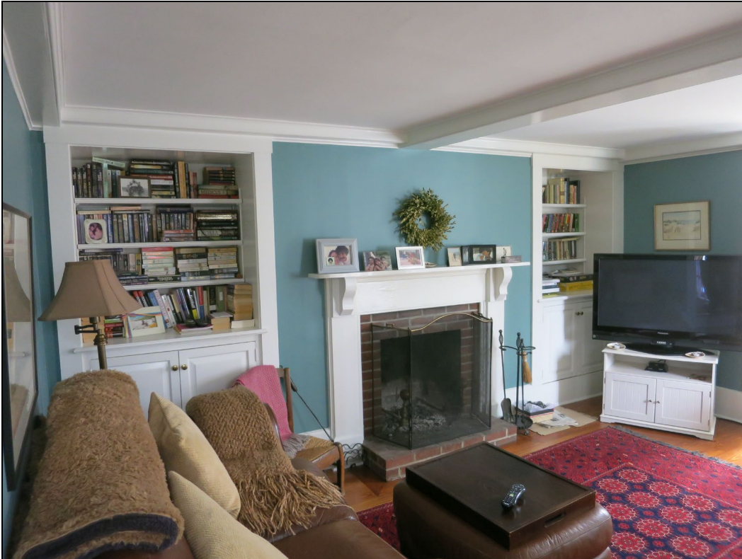
NE sitting room looking NW.