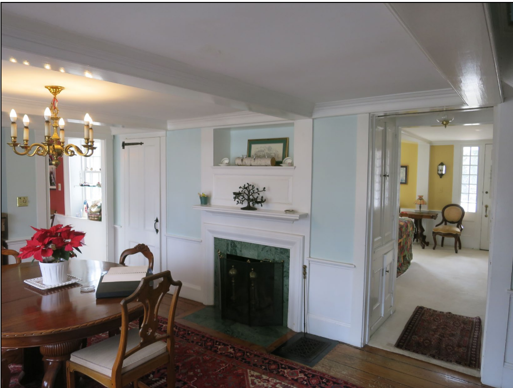
SE dining room looking west.